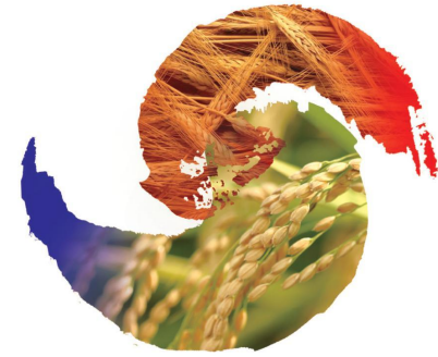
Haneulcheong Korean Traditional Drink